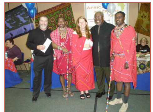
A short-term mission trip to Kenya built relationships with the Maasi.